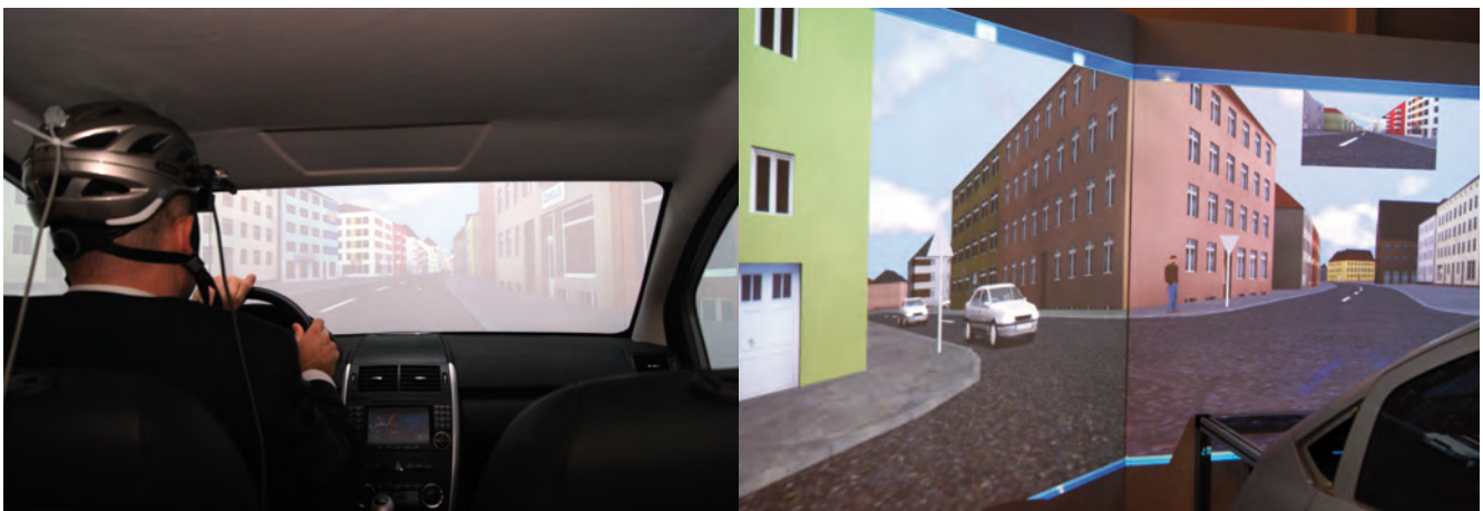
Figure 3: Driving Simulator environment with Subject and gaze measurement device (left) and a typical built-up scene (right)

There is no significant effect of DRL (low beam) on gaze behaviour. Gaze directions do not occur sooner, longer or more often for cars with lights switched on, nor later, shorter or more rarely for vulnerable road users. Both gap acceptance and the distance left to approaching vehicles are not influenced by DRL (low beam). Even in scenarios with a motorcyclist being followed by a car with lights switched on (the assumed worst case scenario of DRL associated risks) no risks could be observed. Different accident types show no significant effects in gaze and driving behaviour which can be traced back to DRL (low beam).