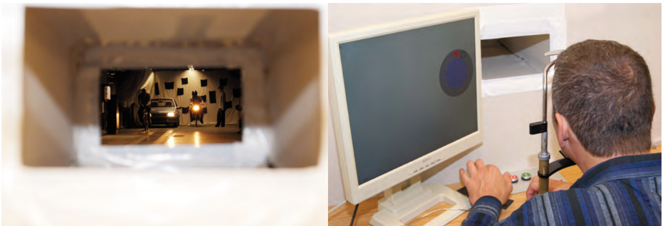
Figure 2: Test persons's view at the scene (left) and positioning of test person with tracking task (right)

The detection performance is not influenced by DRL or low beam. Vulnerable road users are not overlooked more often in any condi-